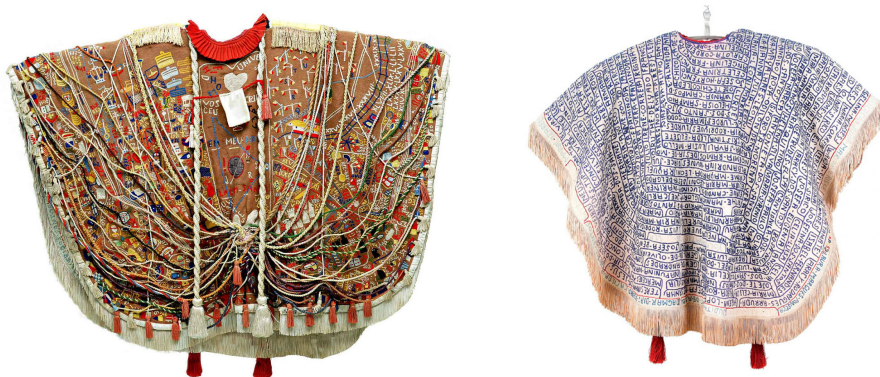
Figure 1 and 2: Arthur Bishop of Rosario Presentation Cloak / Fabric, thread, paper and metal. 118.5 x 141.2 cm. Credit: The Bispo do Rosário Museum Contemporary Art Collection / City Hall of Rio de Janeiro. Photo: Rodrigo Lopes.

The Presentation Cloak was the piece that Bispo do Rosário made through embroidery, names, drawings of objects, fragments of stories, and various historical elements.