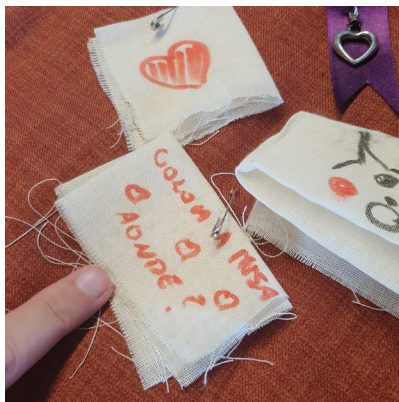
Figure 10: Elements fixed in the heart area. Figure 11: The narrative labyrinth created.

In the second experience the participant created an interactive fiction structure using various story elements and fragments, which had already been created by the other participants. He set up a configuration on the cloak, in which each door of the labyrinth where the character is involved, leads to a narrative fragment created by another participant. And whoever is experiencing the character of this experience has to create a narrative for this element, which works as a kind of fragment of the romantic joke (Brain 2007), as it encourages the participant to create from something that is totally strange and unknown to him.