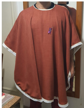
Figure 3 and 4: Storytelling Cloak (brown side) and Storytelling Cloak (raw cotton side).

Functioning as a source of renewal, the cloak continues to exist, and the narrative fragments created by people form a material repertoire of stories, which are collected according to the use of the Storytelling Cloak, and which can be used, resignified and also recombined for the creation of new autobiographies, autofictions, and historical narratives. Thus, the cloak not only helps in the creation and telling of narratives, but it also collects and incorporates the stories wherever it goes.