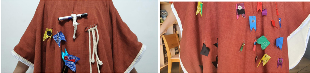
Figure 5 and 6: Participants wearing the Storytelling Cloak.

He later created a micro-roleplaying game, in which three or more people participate in creating a character's life, from beginning to end. In this gameplay, each person uses a fragment of their personal life to narrate a stage in the character's life, and each person continues the story from where the other left off. In the third experience, he related reports and memories of the city, creating a narrative in which Rio de Janeiro is reported from three points of view from different socioeconomic groups, which reflect the enormous social difference that marks the city. After that, the participant described how this story could be turned into an installation: